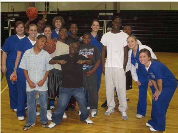
Health Fair: Nursing students from the University of Memphis came to the Streets Center for a Health Fair just prior to the Thanksgiving holiday.