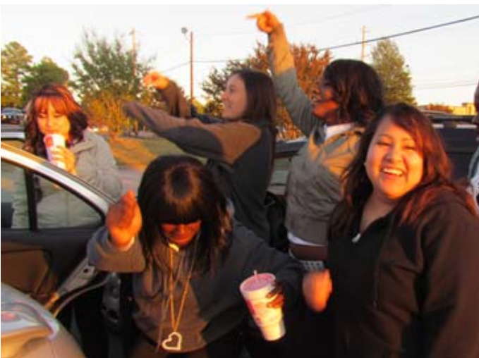
S2G Movie Night: Also known as the "Streets Girl Gathering" group, S2G high school girls enjoy themselves prior to a movie night.