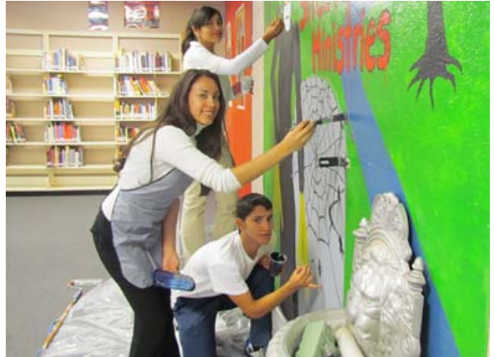
Nobel Mural: Kingsbury High School students put the finishing touches on a mural of Nobel Peace Prize recipients in the cafeteria.