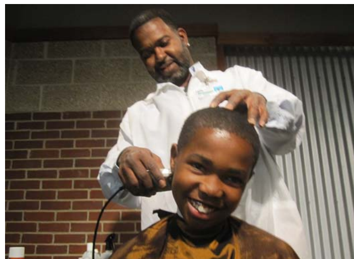
Cuts for Cans: This December Streets is offering "Cuts for Cans" courtesy of the Barbering Program at the Tennessee Technology Center.

While I was standing out in front of the construction site by myself late one afternoon, three young Latino kids walked by the front gate. I went over to them and began a conversation. I asked them if they knew what was being built. When they said no, I told them about the game room and the gym. They said they liked soccer and I let them know that we would have Futsal, a popular indoor form of soccer, available in the gym. Then I asked them the big question – "Do you know who we are building this facility for?" Once again, they said no, to which I said, "Streets is building this for you!" Their smiles were indescribable as they ran down the street high-fiving each other.